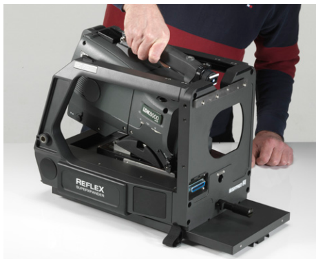
RefleX SuperXpander – Fast and Easy Docking

Two utility power connectors are provided to drive external equipment. Each connector (XLR-4 female) is rated at 13.8V/8 amps. or 120W maximum (combined).