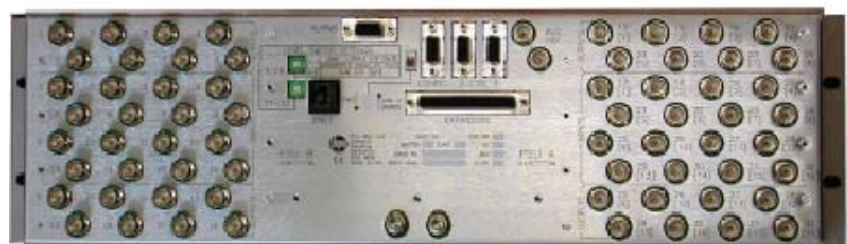
Reverse of Halo frame

The 32 x 16 will appear as a 32 x 32 to any external controller.